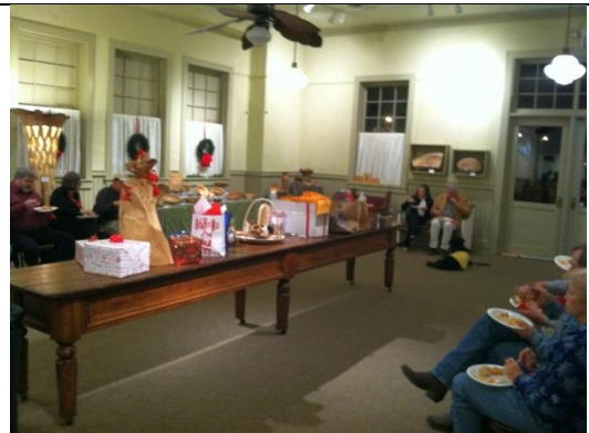
Table full of gifts.